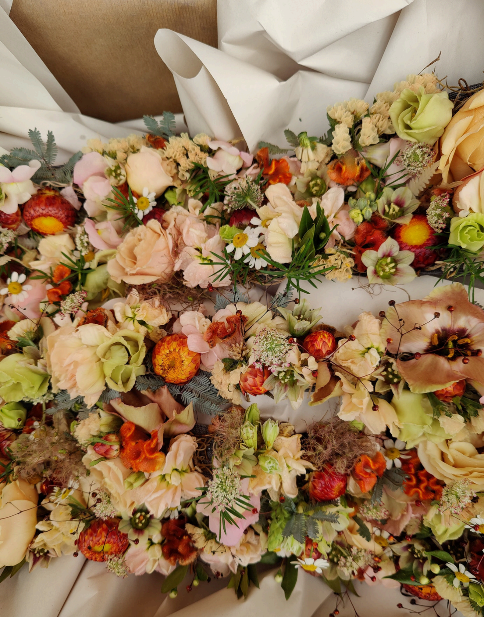
A Silken Caramel Edit (Earthy Terracotta added)